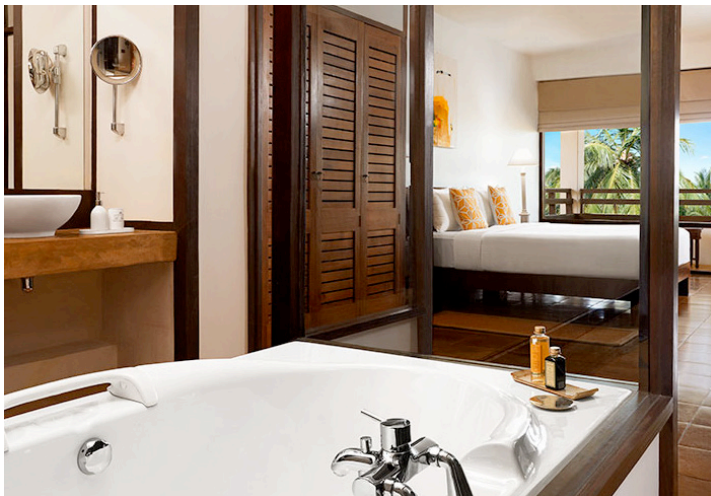
Deluxe Room: Jetwing Beach

architect Geoffrey Bawa, Jetwing Beach is a wonderful example of local design fused with modern architecture, creating a natural invitation that is fitting of our hometown heritage.