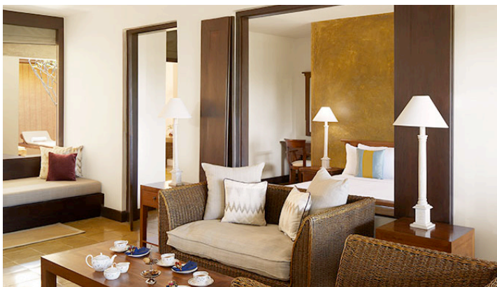
Suite: Jetwing Beach