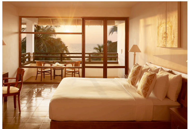
Deluxe Room: Jetwing Beach