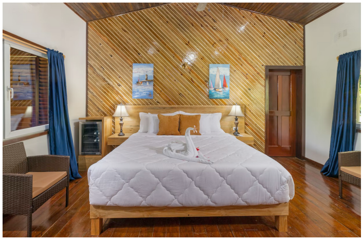
Garden View King