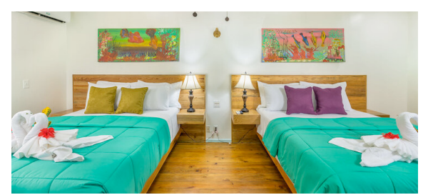
Family Front View