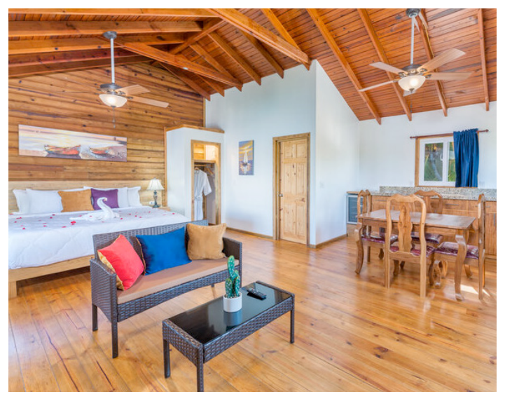
Marina Master King Suite