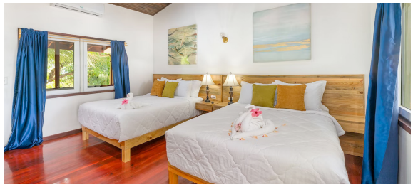
Garden View Deluxe