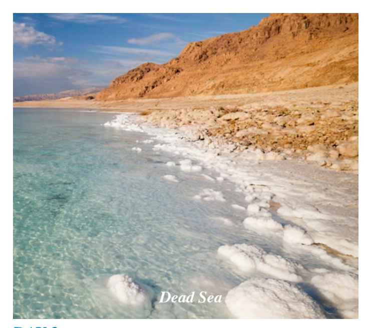
DAY 3: Masada Tour and Dead Sea

Depart Tel Aviv via the Judean Hills to the Dead Sea, the lowest place on earth; Visit a Dead Sea cosmetic products shop. Drive along the shores of the Dead Sea to Massada where you will learn about the heroic story of the Jewish fighters. Ascend by cable car and tour the mountain fortress built by king Herod, where the Zealots of the first century made their last stand against the Romans. Visit the remains of the walls, palace, synagogue, water cisterns, mosaic floors, roman baths and other findings. Descend by Cable Car. Continue to the Dead Sea; Enjoy the unique opportunity to float in the Dead Sea and cover yourself with the mineral rich mud, that many believe has its therapeutic effects. Return to point of departure.