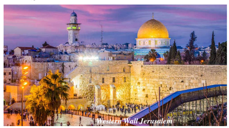
DAY 1: Arrival to Tel Aviv and transfer to Jerusalem

Welcome to Israel! Arrival and private transfer to Jerusalem, check in hotel of your choice.