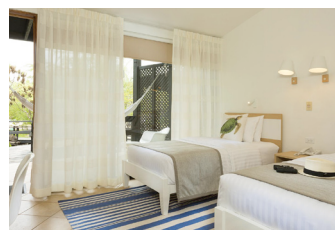
Finch Bay - Garden view