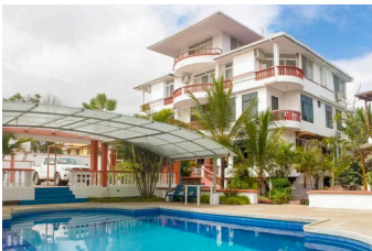
Hotel Deja Vu