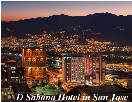
D Sabana Hotel in San Jose