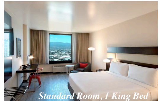
Standard Room, 1 King Bed

We recommend the D Sabana Hotel in San Jose. It is the only hotel that Aggressor will provide transfer to and from the yacht. You might like to consider adding a couple of days at the beginning or end of your dive vacation to take advantage of some wonderful tours in Costa Rica.