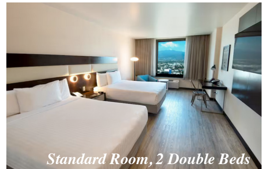
Standard Room, 2 Double Beds

The D Sabana Hotel boasts a strategic setting at the heart of the Don Bosco neighborhood in San Jose. The hotel is situated just a short driving distance from the airport. This upscale hotel greets guests with charm and style, welcoming them into a relaxing world, seemingly miles away from the city which lies just outside. The guest rooms are exquisitely appointed, featuring modern amenities for added comfort and convenience. The hotel offers exemplary facilities, ensuring a relaxing stay.