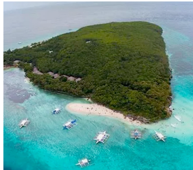
Sumilon Sand Bar