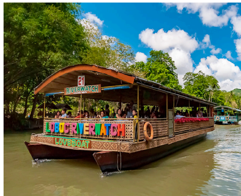
Loboc River Cruise