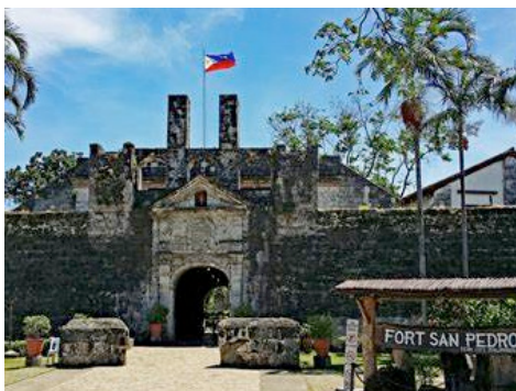
Fort San Pedro