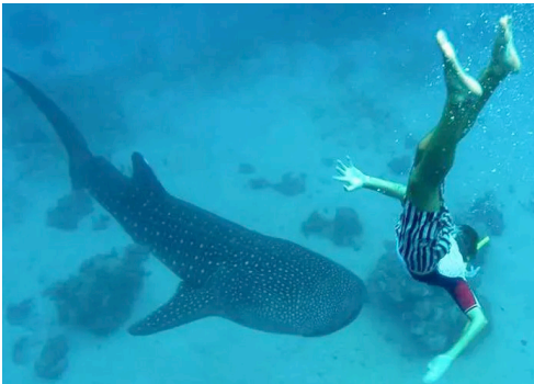
Oslob Whaleshark Encounter