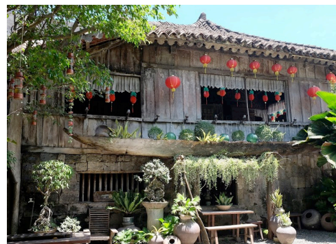
Yap Sandiego Ancestral House