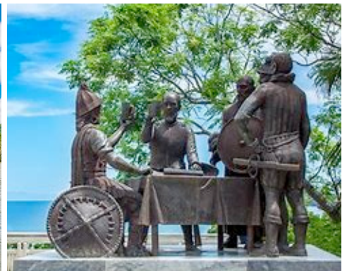
Blood Compact Site