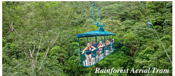
Rainforest Aerial Tram

Tabacón Hot Springs combines the four elements of nature; the heat of the volcano, the flowing waters of the hot springs, the pure air of the rainforest, and the fertile earth of the Fortuna de San Carlos Region.