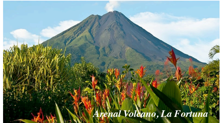
Arenal Volcano, La Fortuna

out of wood (cedar) and decorated with bright colors, designed based on our typical and traditional oxcarts. The journey will then continue, traversing diverse plantations with agricultural products, including pineapple and plantain farms, mango groves, ornamental plants and even cattle ranches until arriving to the small town of La Fortuna, and stopping to enjoy lunch at a cozy restaurant with a magnificent view of the volcano.