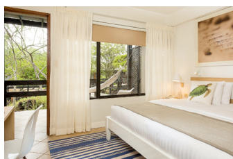
Finch Bay - Finch Room