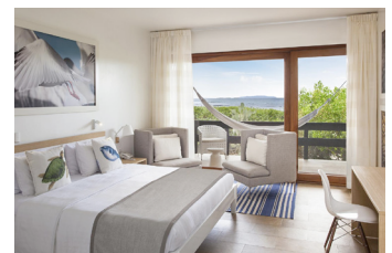
Finch Bay - Ocean View Suite