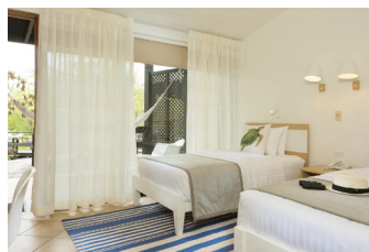
Finch Bay - Garden view