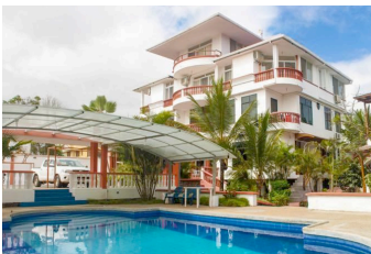
Hotel Deja Vu