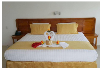
Hotel Deja Vu