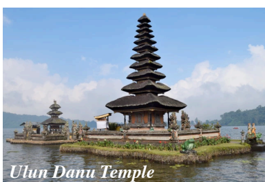
Ulun Danu Temple