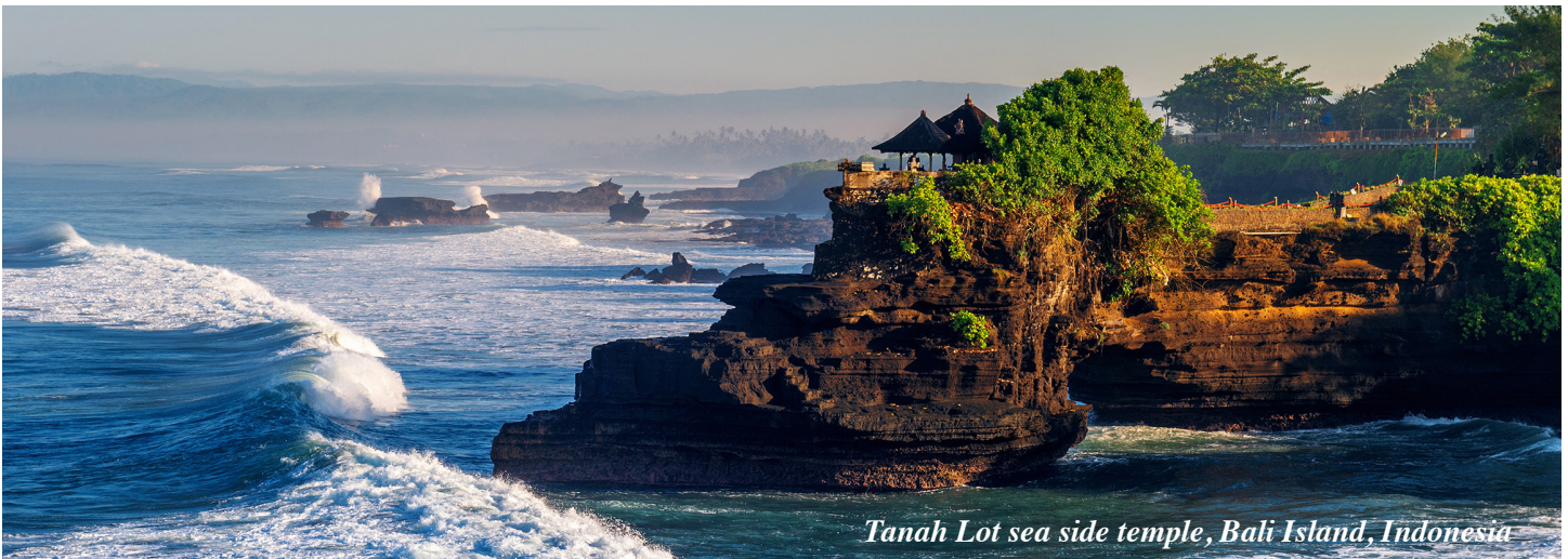
Tanah Lot sea side temple, Bali Island, Indonesia