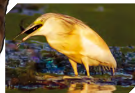
Bird Watching Excursions Nile River, Egypt Northern Sri Lanka

· Bahamas · Belize · Cayman Islands · Cocos Island, Costa Rica · Cuba · Dominican Republic · Galapagos · Indonesia · Maldives · · Nile River, Egypt · Palau · Philippines · Raja Ampat · Red Sea, Egypt · Roatán, Honduras · Sri Lanka · Thailand · Turks & Caicos ·