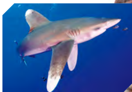
Red Sea Aggressor V® March 2025 Zabargad and Rocky Islands, or Elba Reef