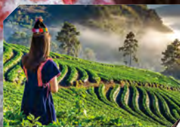
Aggressor Signature Lodges® Chiang Mai, Thailand November 1, 2025 Northern Thailand