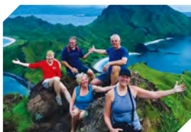
Komodo Aggressor® May 1, 2025 Komodo National Park, Sumbawa, Alor Archipelago, Banda Sea or Sulawesi

NEW AGGRESSOR® DESTINATIONS AWAIT TO SATISFY YOUR SOUL